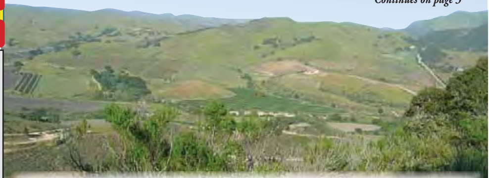
Ampelos vineyard - the vineyard blocks planted in 2001 are to the left.

SPEC'S UPDATE is a publication of Spec's Wines, Spirits & Finer Foods. All prices listed are subject to change without notice. ALL PRICES LISTED ARE FOR SPEC'S SMITH STREET SUPERSTORE AND INCLUDE A FIVE PERCENT DISCOUNT FOR CASH. (Many items are available at Spec's Neighborhood Stores at different prices.) All items are offered "first come, first served" and are subject to availability; some quantities may be limited. Spec's reserves the right to restrict quantities. Spec's is not responsible for errors in printing. Typographical errors will not be honored. "Spec's" and the rabbit logo are service marks of Spec's Family Partners and are registered with the State of Texas.