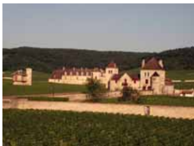
Ch. de la Tour (on the right) with the Ch. de Clos Vougeot in the background.

Tech: 100% Pinot Noir fermented using open tops and punch-downs and aged 14 months in French oak barrels (35% new). Medium purple-violet in color with well formed legs; dry, medium-full-bodied with freshly balanced acidity and moderately chewy phenolics. Juicy, supple and alive. Dusty with red cherry-berry fruit. Notes of cherry and raspberry with a hint of cranberry. Well structured, delicious, complete. Big but somehow still elegant. Excellent. BS: 92.