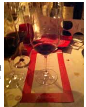
Wonderful event held at Chateau la Couspaude